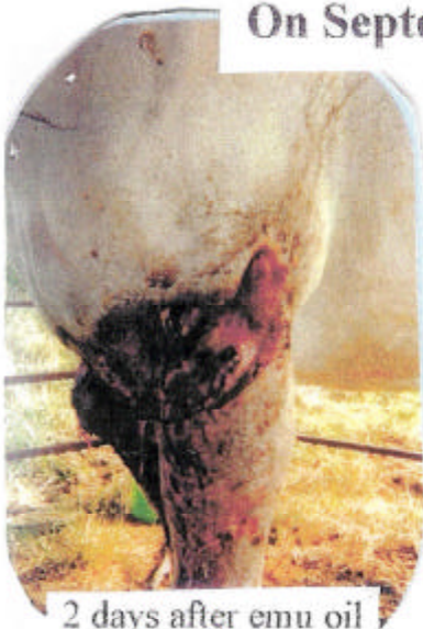
2 days after emu oil