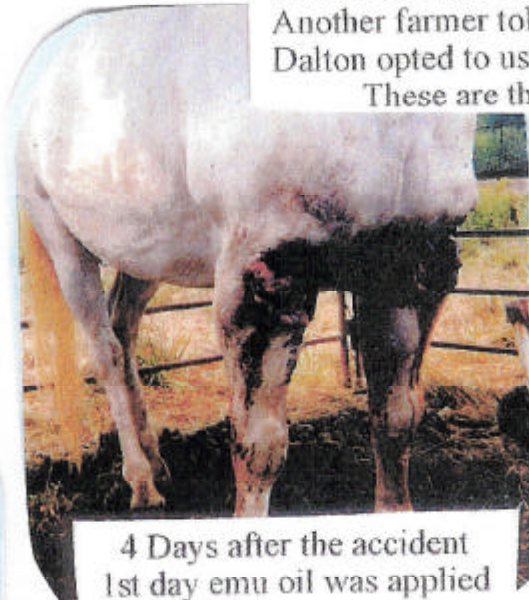
4 Days after the accident 1st day emu oil was applied