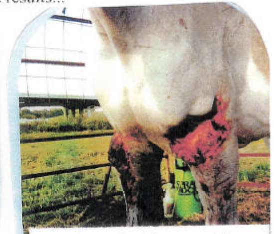
3 weeks after emu oil Mare laid down for the first time The next day she walked.